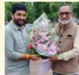
Shri Murlidhar Mohol, Union MoS & Trinity CMD