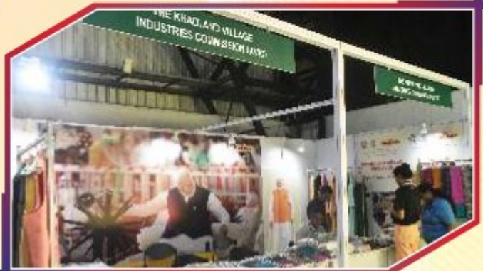
THE KHADI & VILLAGE INDUSTRIES COMMISSION