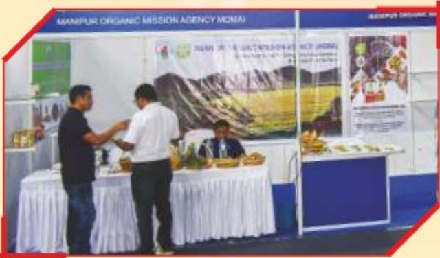
GOVERNMENT OF MANIPUR - MOMA