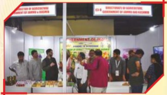
GOVERNMENT OF JAMMU & KASHMIR