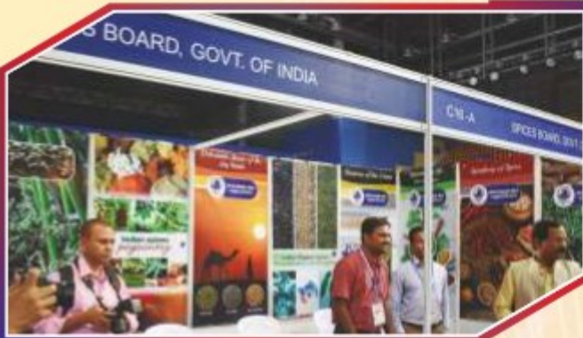
SPICES BOARD, GOVT. OF INDIA MINISTRY OF COMMERCE & INDUSTRY