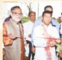
Union Food Pro Minister, Shri R Teli inaugurating