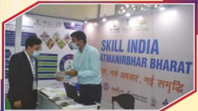
MINISTRY OF SKILL DEVELOPMENT AND ENTREPRENEURSHIP, GOVT. OF INDIA