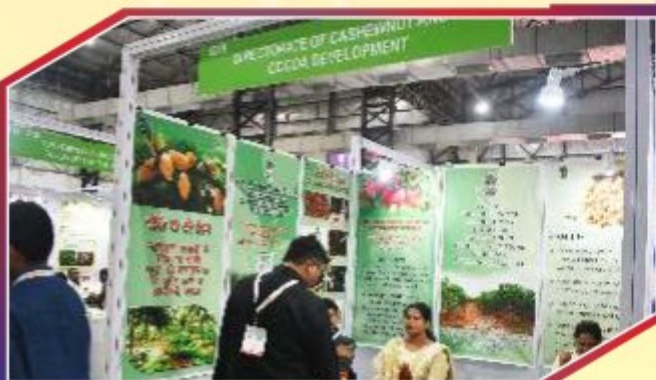
DIRECTORATE OF CASHEWNUIT & COCOA DEVELOPMENT