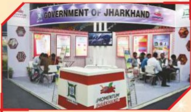
GOVERNMENT OF JHARKHAND