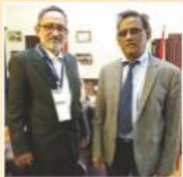
President of Mauritius & CMD of Impex Chamber