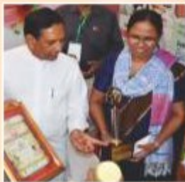
Sri Lankan Minister & Kerala Health Minister