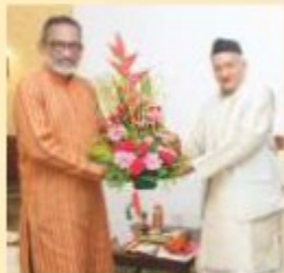
Governor of Maharashtra & Impex Chamber Mg. Dir.