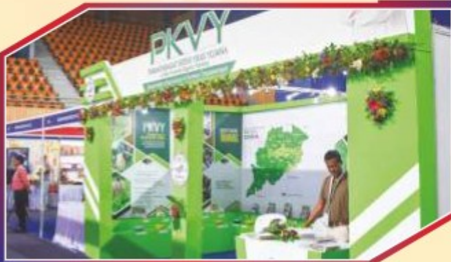
GOVERNMENT OF ODISHA