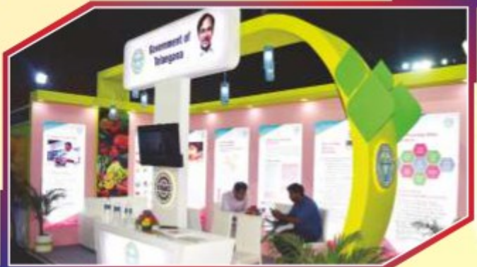
GOVERNMENT OF TELANGANA