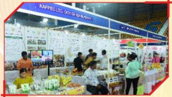
GOVERNMENT OF KARNATAKA