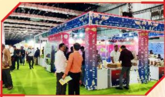
FOOD PROCESSING OF UT LADAKH