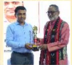
Hon Chief Minister of Goa & Impex Chamber Mg. Dir.