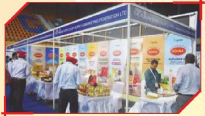
GOVERNMENT OF PUNJAB