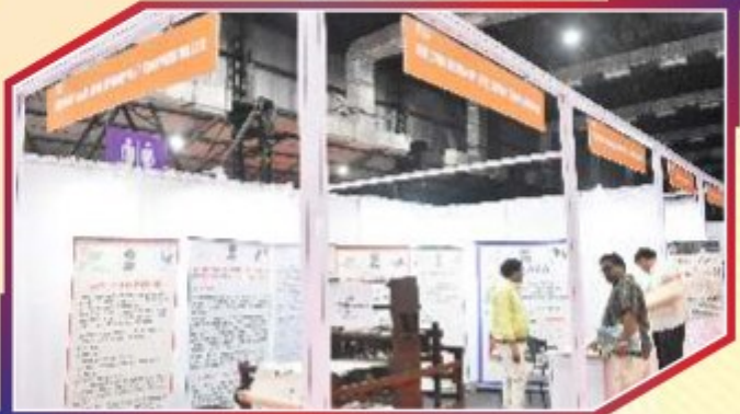
NATIONAL HANDLOOM DEVELOPMENT CORP. LTD.