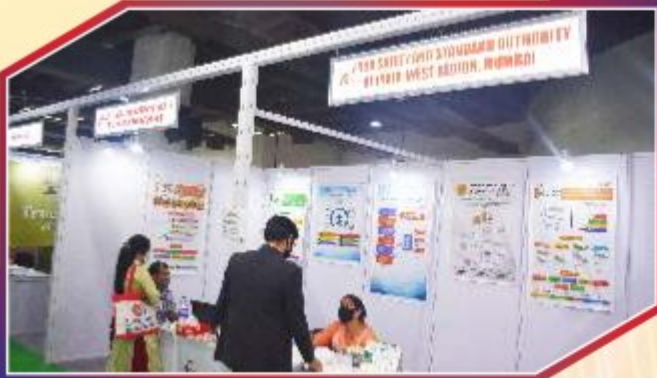
FOOD SAFETY & STANDARD AUTHORITY OF INDIA