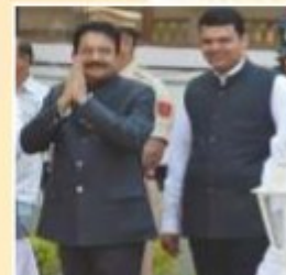
H. E. Governor Rao & CM Fadnavis of Maharashtra