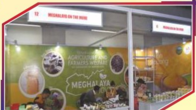
GOVERNMENT OF MEGHALAYA