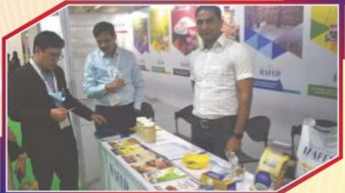
GOVERNMENT OF HARYANA, HAFED