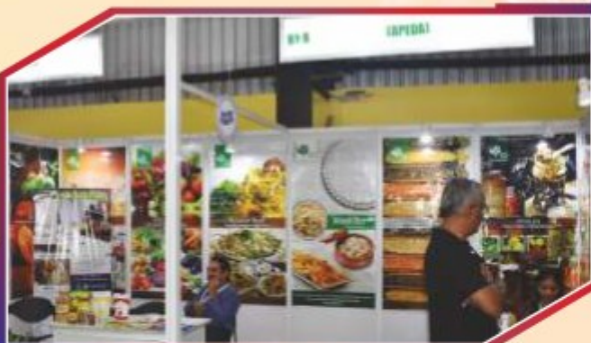
APEDA Pavilion - Agricultural Products Export Dev. Authority, Ministry of Industry & Commerce