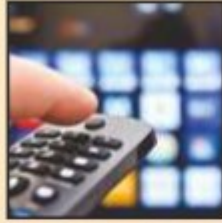
TV & Cable Channels