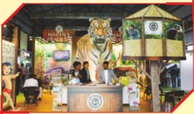
GOVERNMENT OF MADHYA PRADESH