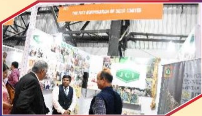
THE JUTE CORPORATION OF INDIA LIMITED