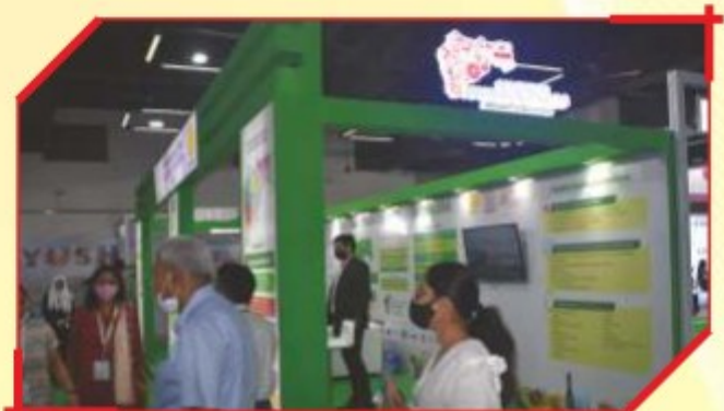
GOVERNMENT OF MAHARASHTRA - MIDC