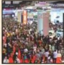
In Venue Displays