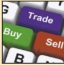
Associations & Chambers