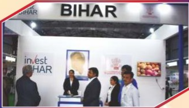
GOVERNMENT OF BIHAR