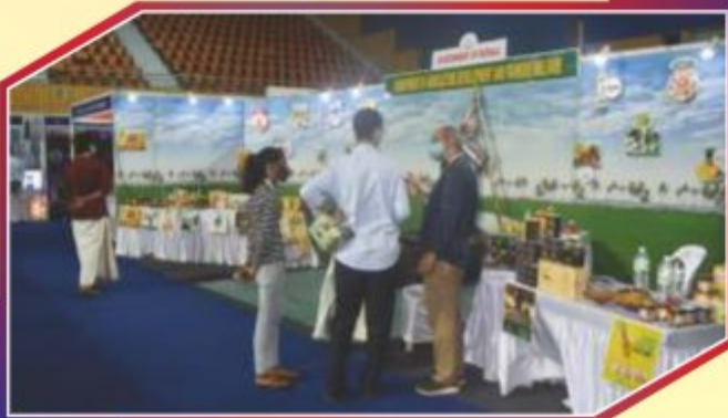
GOVERNMENT OF KERALA